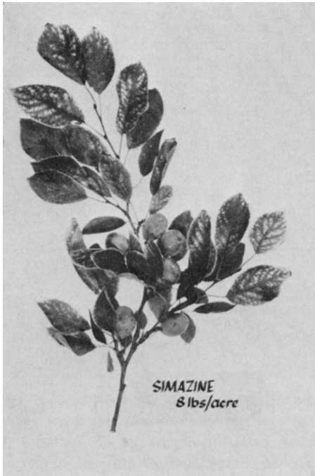
Phytotoxicity symptoms on the foliage of prune trees from root uptake of simazine applied at high rates.