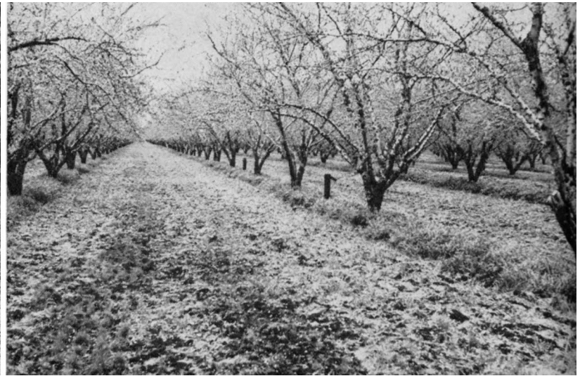
right was flood-irrigated with borders on the tree row, and no herbicides used.