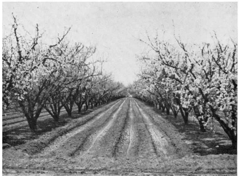
Photo shows a raised bed along the tree row for furrow irrigation in a deciduous orchard.

All herbicides tested showed very little evidence of injury under furrow irriga-