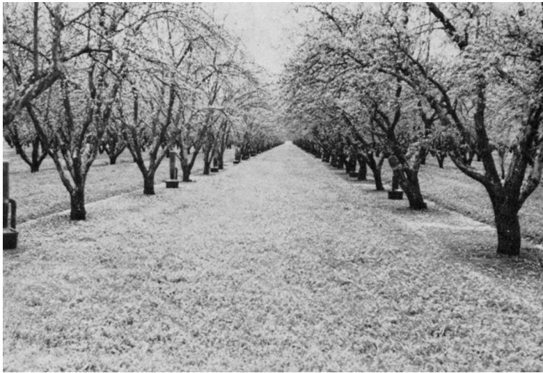
Almond orchard above, left, was set up for sprinkler irrigation, with herbicides used down the tree row, and centers mowed. Orchard to