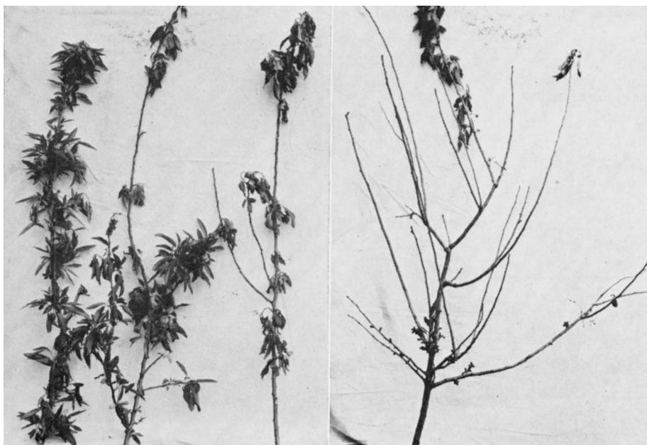
Variation in the expression of BF in different seedling almond plants of the same age. These were from a cross of Texas \times Jubilee-BF. The differences are shown by different proportions of failing buds on these shoots. Shoot on left is normal.

Noninfectious bud failure (BF) is a disorder caused by a peculiar genetic abnormality characteristic of certain almond varieties. It is a serious economic problem in that many thousands of trees have had to be replaced and at least one variety, Jordanolo, is being eliminated because of its susceptibility to BF. The disorder is expressed by the failure of vegetative buds to grow in the spring. This, along with other roughbark characteristics, results in a distinctive growth pattern sometimes also described as "crazy-top." Trees do not die but production in individual trees is reduced in proportion to the severity of the symptoms. Experimental work on the disorder can be divided into two basic problems discussed here in two separate articles. One concerns the nature of the disorder and the origin of the BF condition, and is studied in the first article. The other (studied in the second article) involves the sporadic appearance of BF in such important varieties as Nonpareil, and deals with practical methods to identify and control it.