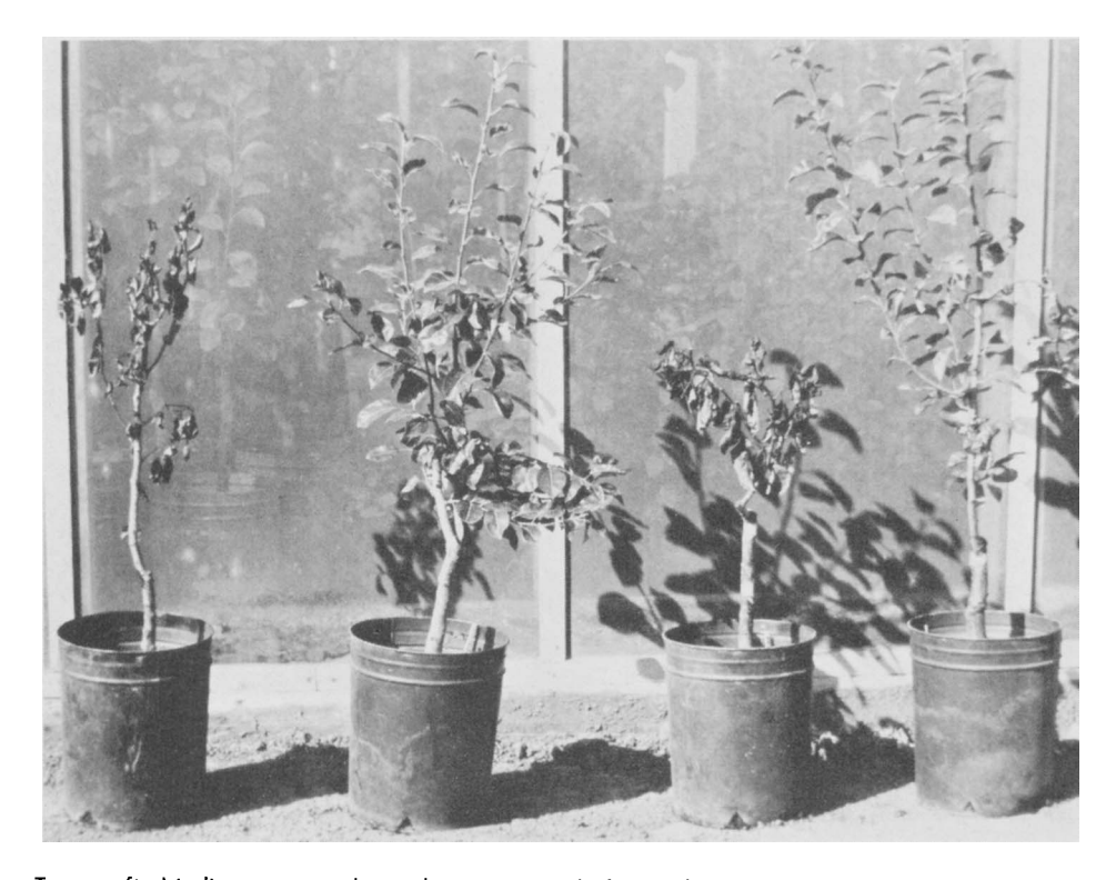
Two grafted indicator trees above showing pear decline collapse and two ungrafted check trees showing healthy condition as a result of decline-tolerant rootstock.

equal numbers of weak and vigorous orchard trees in an attempt to transmit the decline virus, if present. A few small ungrafted indicator trees were also placed in each orchard as checks. A total of 217 trees were placed in the eleven plots (table 1).