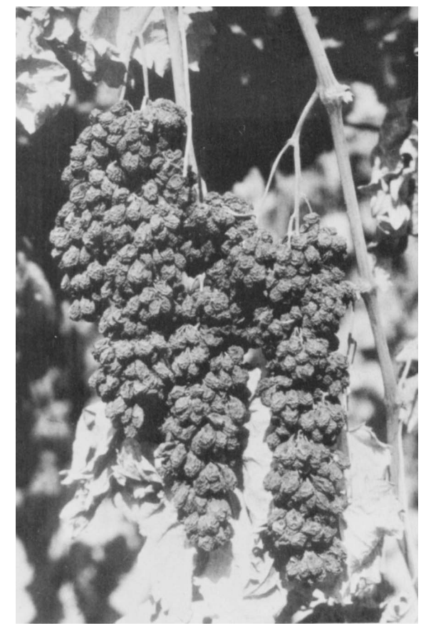
Clusters of on-vine dried Black Corinth raisins ready for machine harvest.