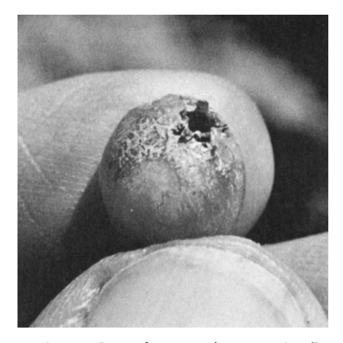
Cover photo shows a Thompson Seedless berry heavily scarred at the stylar end where the calyptra is persistent (photographed June 1971).