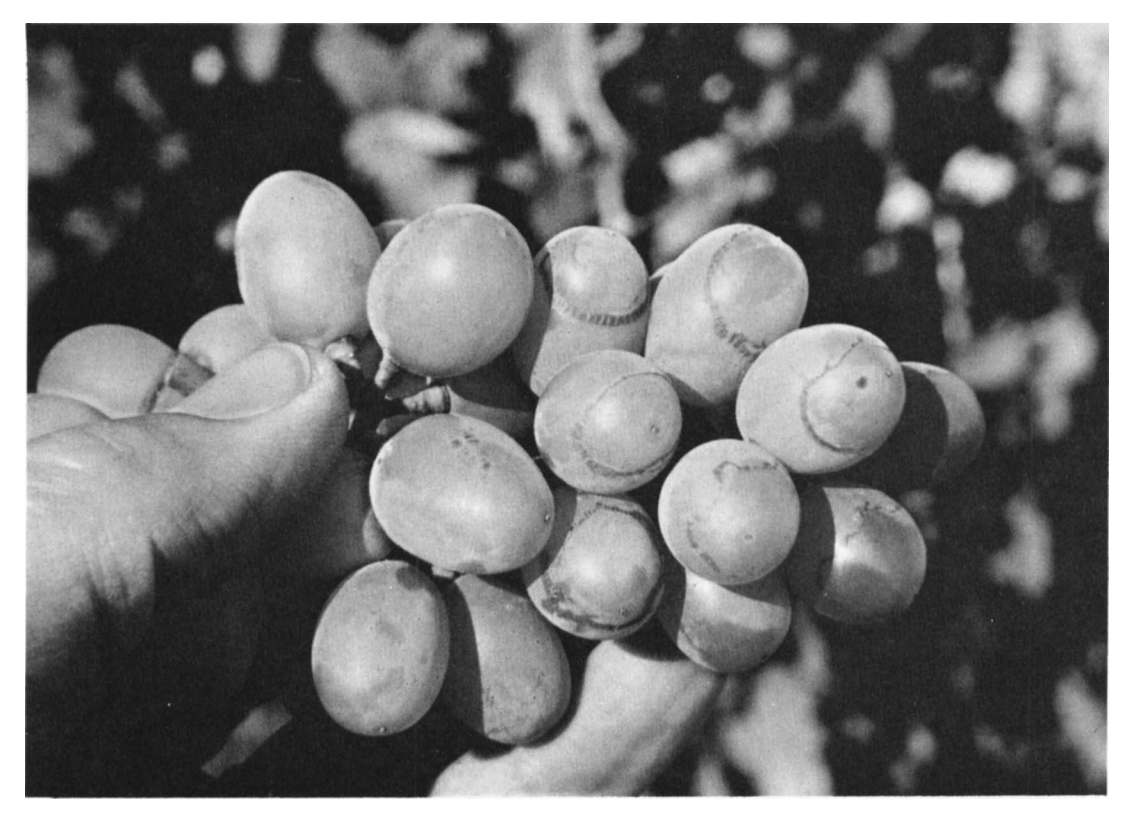
Ring scarring on Thompson Seedless table grapes at harvest. This pattern can result from the use of excess wetting agent in the gibberellin sizing spray.

ring on the berries of the Thompson Seedless variety. While most of the scarring in previous years had been in a ring pattern around the stylar end of the berry, some of the rings occurred where two adjacent berries touched (photo). These ring scar patterns were generally located where the droplets of spray coalesced and collected as a large drop which on drying left a scar on sensitive berries. In contrast, the new type of scarring, aptly called sunburst or starfish by local growers, is characterized by an irregular scarring pattern somewhat in the shape of a starfish (photo). Sometimes the scarring patterns were similar in shape to those of adhering calyptras with extended petal parts (cover photo).