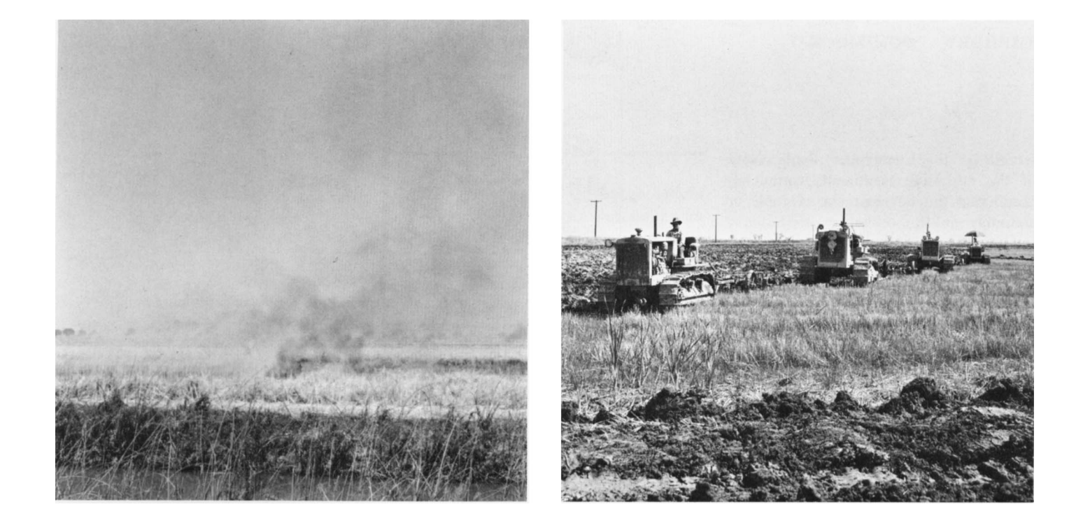
EFFECT OF STRAW TREATMENT AND FERTILIZER NITROGEN ON GRAIN AND STRAW YIELD AND NITROGEN ECONOMY OF COLUSA RICE—AVERAGES FOR 8 CROP YEARS