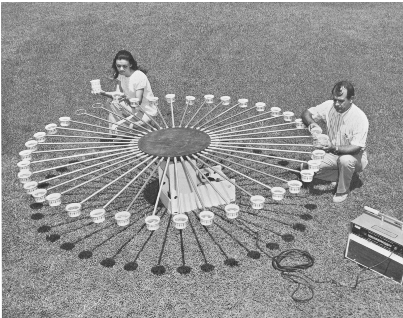
TABLE 3. ATTRACTANCY OF UC FLY ATTRACTANT AND A COMMERCIAL SUGAR-TOXICANT FLY BAIT (SCATTER BAIT—SHELL CHEMICAL CO.) AGAINST PEST FLIES AS TESTED IN AN OLFACTOMETER ON A CATTLE FEED YARD a