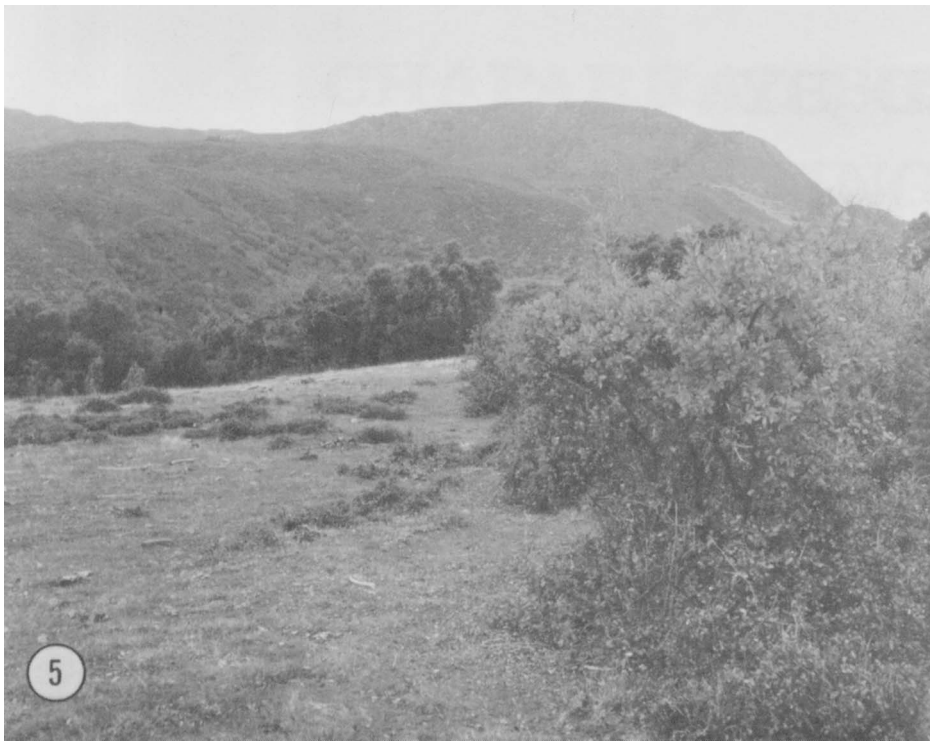
5. Manzanita was the dominant shrub (right) where grazing was the only treatment, while the burn treatment area (left) shows only low growing live oak shrubs (photo March 12, 1973).