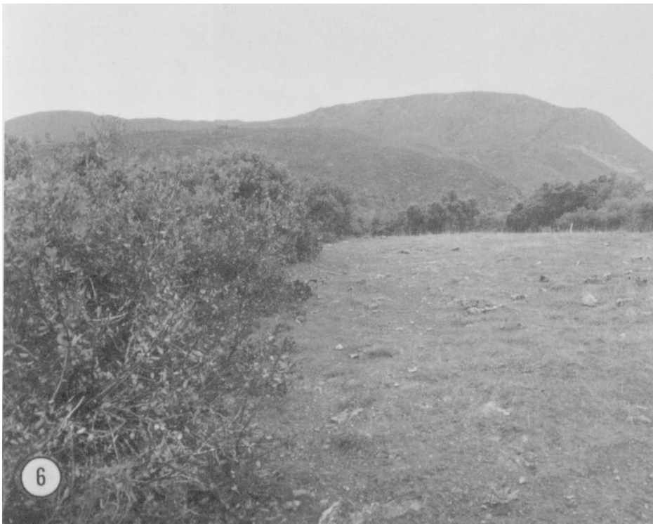
6. Chemically treated shrubs (right) show no new plants developing after 14 years, whereas the shrubs (left) with only grazing have crowded out grass cover (photo March 12, 1973).

( Ceanothus foliosus ), poison oak ( Rhus diversiloba ), chaparral pea ( Pickeringia montana ), and coyote bush ( Baccharis pilularis ). Of these eleven species, all but two sprout from the basal stumps. Manzanita, chamise, and ceanothus also develop dense stands of seedlings following burning, providing strong competition to herbaceous vegetation. Many brush seedlings die from water stress; only a few survive when a dense stand of grass is present.