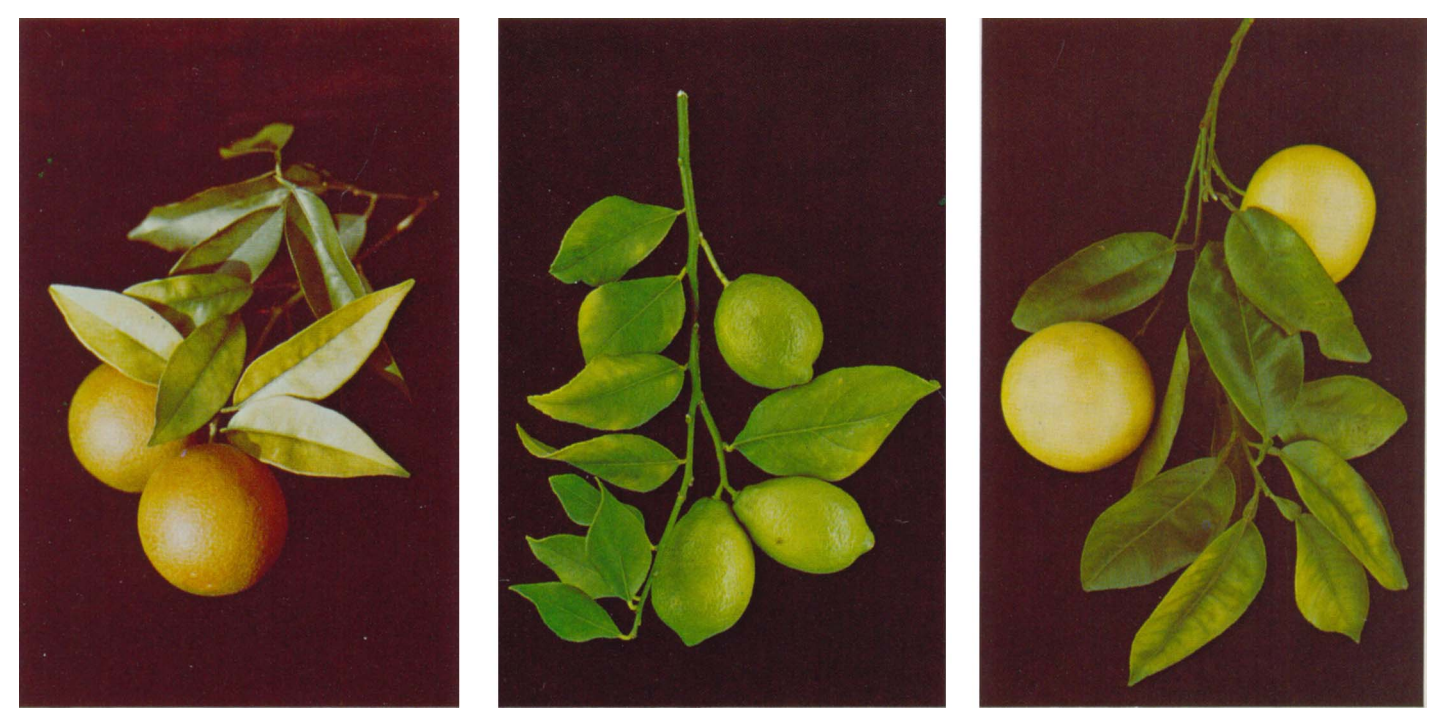
Potassium deficiency symptoms (left to right) on orange, lemon, and grapefruit show up in yellow-bronze chlorotic patterns on leaves, as well as cork screw type curling toward lower leaf surface, particularly on lemon.

effects for grapefruit are similar to those for orange.