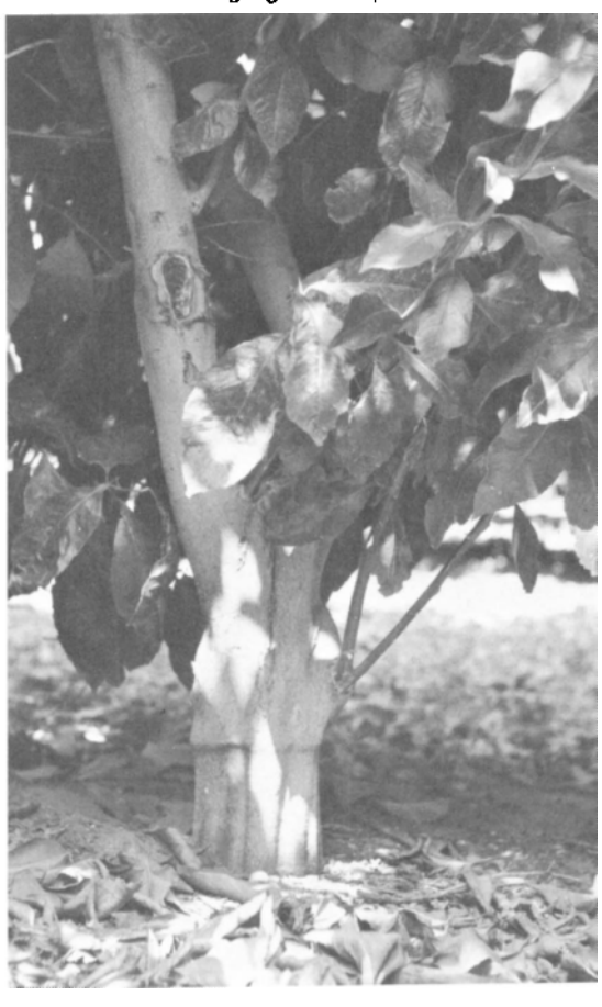
Photo 2. Untreated trunk 14 months after being | showing regrowth of sprouts.