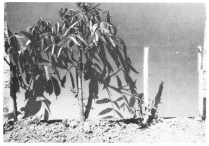
Photos above show effect of sunburn protective treatment on early shoot growth of Payne walnut—left photo, trees painted at union only as indicated; right photo, trees treated stock/union/scion.