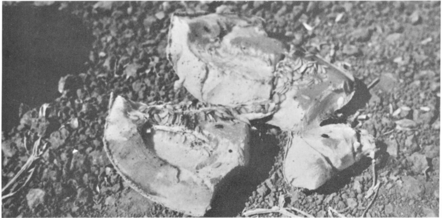
Cull cantaloupe showing adult Musca domestica and Calliphora sp. in the act of oviposition.