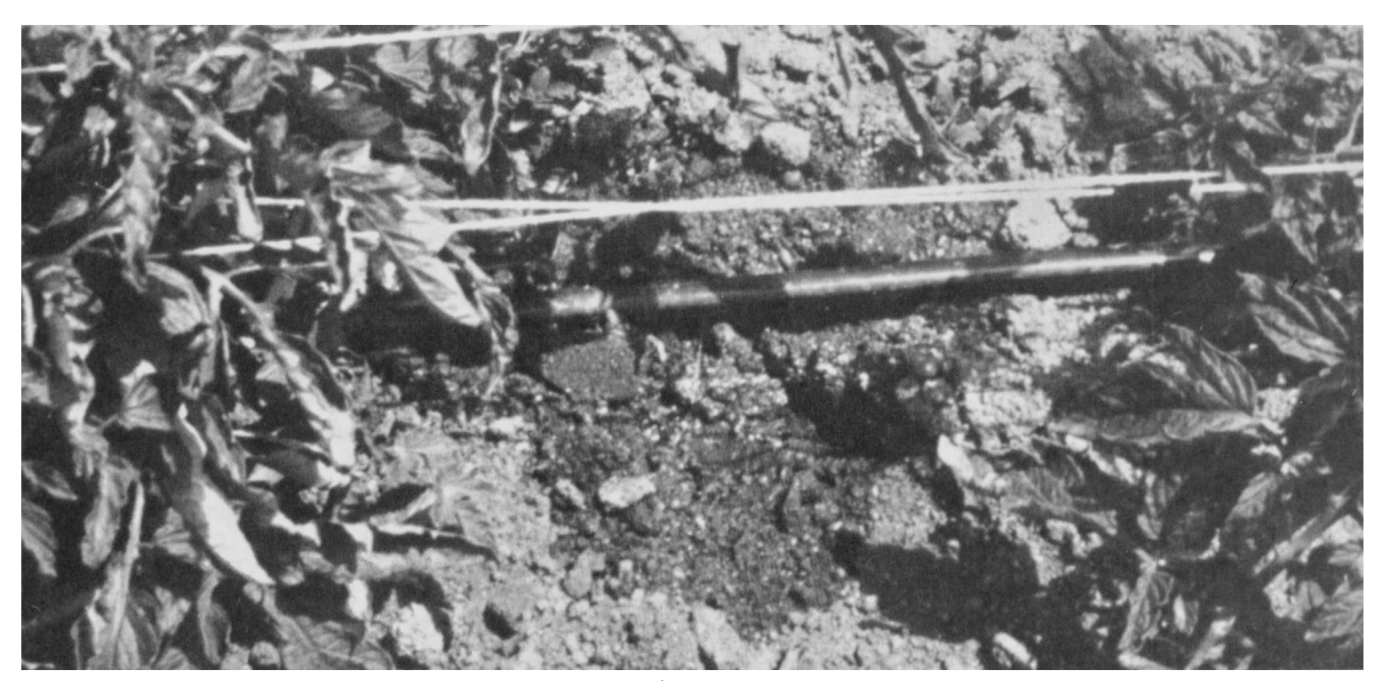
Biwall drip irrigation tubing placed at the base of tomato plants. Note the wetted area around the outlet.

two adjacent plots furrow-irrigated at different frequencies illustrate the striking influence of irrigation frequency on water penetration. A final cultivation at the end of May failed to improve penetration significantly. The restriction to water penetration caused by frequent furrow irrigation is believed to be a relatively shallow surface pheonomenon on this soil, related to particle dispersal, orientation, and a possible biological growth-reducing effective pore volume. Rate of water penetration may vary considerably in a short radial distance in this soil. An adjacent tensiometer-monitored replication of the frequent furrow treatment showed adequate water penetration at both 12- and 24-inch tensiometer placement depths through mid-June. Thereafter, however, no irrigation penetrated to the 12-inch depth. Graph 1 compares plots that were side by side in the study.