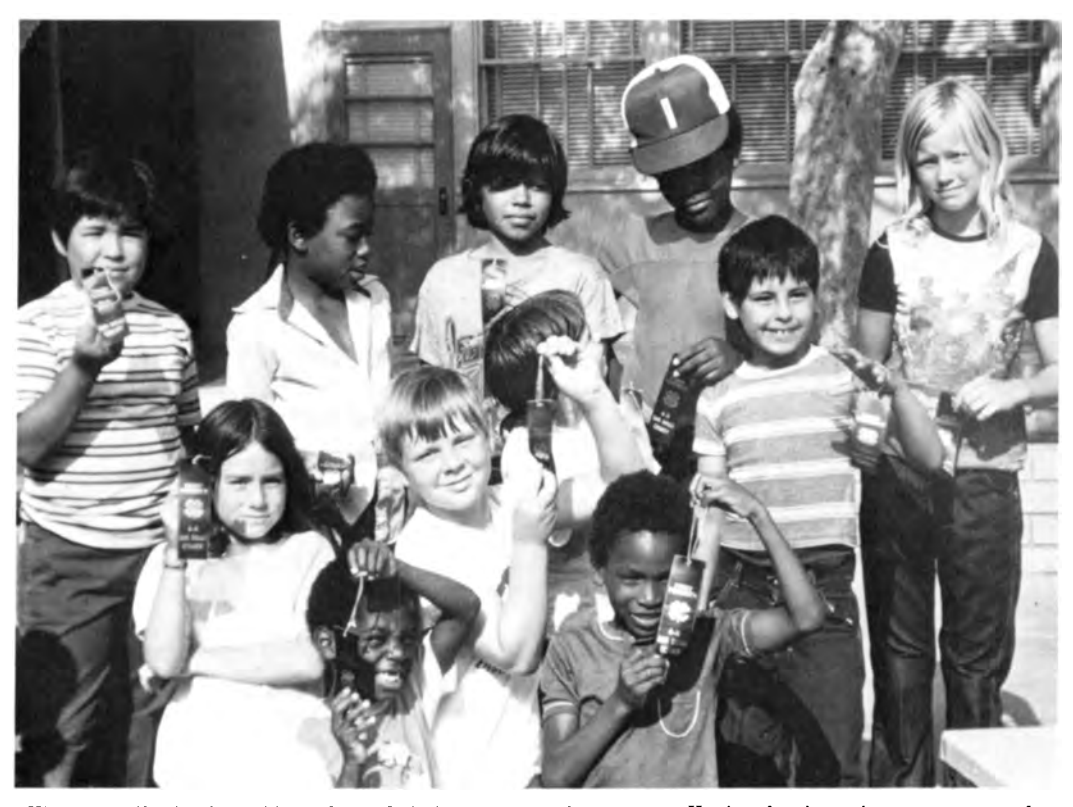
San Diego County 4-H'ers proudly display ribbons from their ice cream eating contest. Having fun is an important part of any 4-H project, and Community Pride is no exception.

n the urban area of Fresno, a group of youth campaign to make public transportation more widely available in their community.