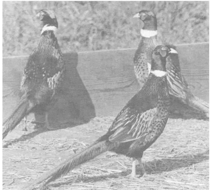
Mongolian pheasants in rearing pen.