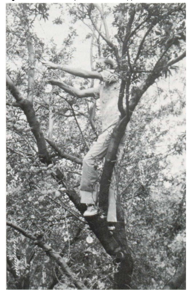
Fig. 4. Placement of sticky discs in free canopy.