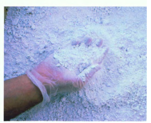
Dry powder formulation of plant-growth-promoting rhizobacteria for seed or seed piece treatment.

cant decreases in plant growth, ranging up to a 69 percent reduction in seedling weight of sugar beets. The PGPR were antagonistic in vitro to most of these deleterious bacteria. The role of deleterious bacteria in depressing root growth is under study.