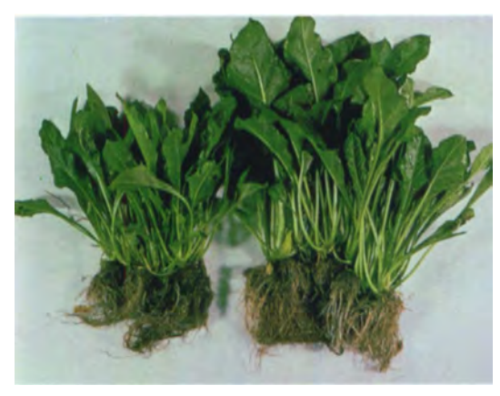
Seedling growth of sugar beet increased by pelleting seed with plant-growth-promoting rhizobacteria.

field plots, each testing three to six different PGPR for ability to increase growth and yield of potato, radish, and sugar beet, have been evaluated since 1975. The experimental design was either a randomized complete block or a Latin square with five to eight replications. In some cases plots were not followed through to harvest due to the nature of the test being conducted or because of problems in growth and care of the crop that were not related to the experiment.