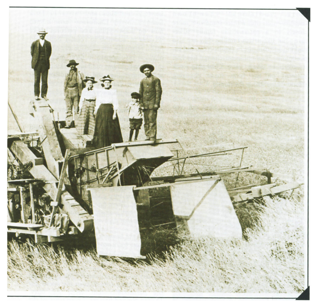
the photographing of this Best Baby Junior side-hill harvester built around 1910.

Years ago half the ranch would be in grain, half was summer fallow each year. We didn't fertilize like they do now. You had to let the land rest to ensure you could bear a crop. We grew barley. Now they plant wheat.