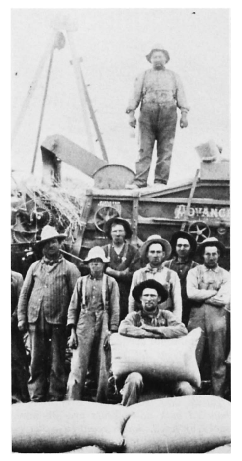
This threshing crew poses in front of its thresher built around 1900 by the Advance Thresher Company of Battle Creek, Michigan. Operated by PTO (power take-off) belt, the separator, by means of a series of shaking screens, separated the grain (in bags, foreground) from the straw.

more "traditional" than urban families—i.e., they adhere somewhat more closely to a paternalistic family structure—but like urban families they are also making adjustments in family roles and expectations. Technological change has had its effect in subtle ways. Changing work patterns on the farm mean changing relationships within the family.