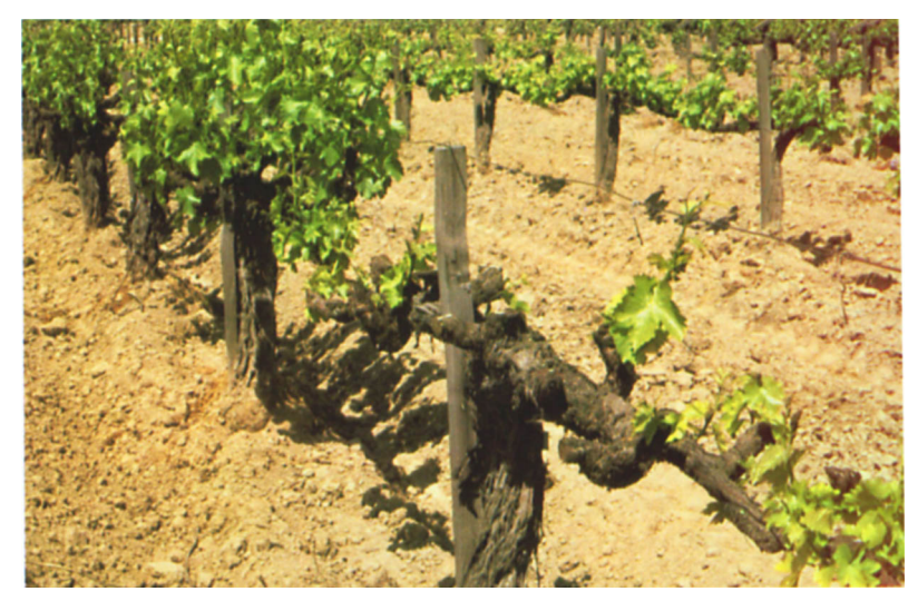
Older vines fared poorest in mechanical pre-pruning tests.

The bud numbers per vine are the averages for all varieties and differed considerably among varieties. Chenin blanc, for example, had 102 buds per vine with minimum pruning, and French Colom-