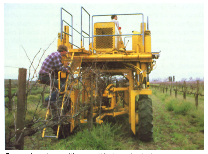
Pre-pruning vines with a modified mechanical grape harvester reduced yields of most varieties in U. C. tests. More sophisticated commercial machines facilitate pruning, but require follow-up by hand pruners.

The machine used was a mechanical grape harvester with the picking head replaced with a pruning head consisting of six circular saws arranged in an inverted "U" configuration. The two upper horizontal saws could pivot around the stake. Their height above the cordon could be constantly adjusted by an operator whose only function was to position these two saws. The positions of the vertical double saws, one set on each side of the vine, were adjusted before pre-pruning began but not while in operation. The lower of