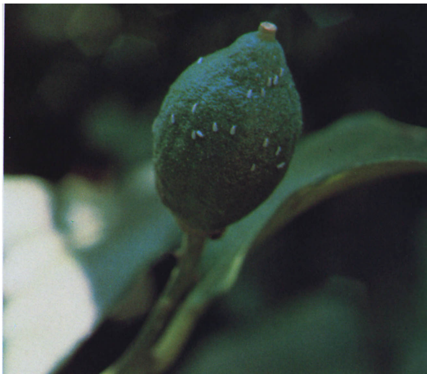
Above: Adult Japanese bayberry whitefly with small, white, newly deposited eggs on young lemon about 3 cm in diameter. Left: Adults and newly laid eggs on young lemon shoots. Below left: Fourth-stage larvae with eye spots and wax fringe. Below right: Adult on leaf with eggs of various ages.