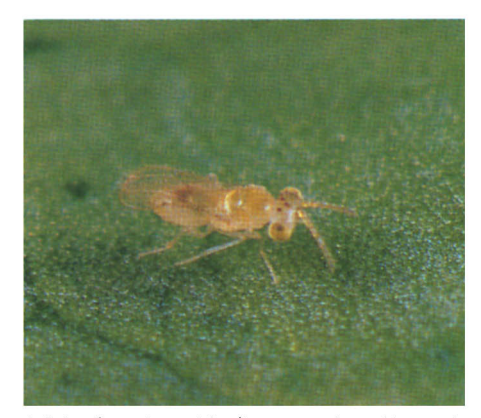
Adult female whitefly parasite, Encarsia lahorensis , is less than 1 mm long.

When the citrus whitefly, Dialeurodes citri Ashmead, was first found in Marysville, California, in 1906, every reason existed to fear and respect this pest, because of the extreme damage it had caused to Florida citrus during the early 1900s. Also, the materials and methods used to combat the whitefly there were expensive and not wholly adequate. Eradication measures in California were suggested almost at once, but C. W. Woodworth's (1907) assessment of the citrus whitefly invasion of Marysville proved sadly prophetic: "Now, if ever, is the time to make an effort to destroy the pest. There is no possibility of throwing a quarantine around the infested district that a flying insect will respect." Further, "A campaign of eradication should include: first, the immediate destruction of every leaf on all citrus trees in Marysville and of every other plant known to furnish sustenance to this insect." Finally, however, he states, "It may be that already the insect has gotten beyond control, but the chance of eradication is certainly worth the effort."