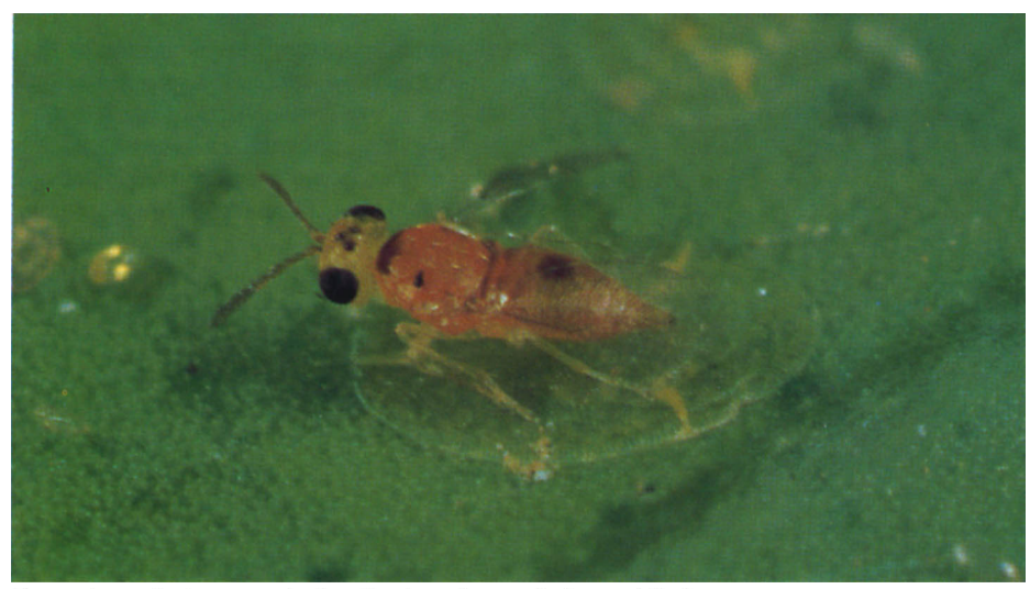
Encarsia sp. laying eggs in fourth-stage larva of citrus whitefly.