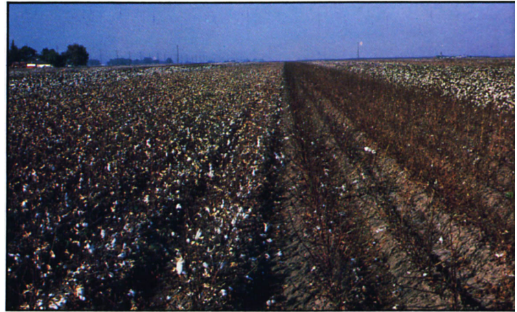
Narrow-row cotton spacing raised yields and lowered production costs, but also created trash problems. Experimental brush stripper harvested 30-inch rows at right; conventional spindle picker harvested 40-inch rows at left.

Cotton has traditionally been grown in rows spaced 38 or 40 inches apart. Research and field testing began in 1970 in the San Joaquin Valley to determine how growing cotton in narrower row spacings would affect yield, production costs, earliness, and fiber quality. This research program was prompted by grower interest in lowering production costs for a greater net return. Attention in recent years has also been focused on the use of narrow-row spacings in a shorter production season that would provide a longer host-free period as a potential means of controlling the pink bollworm and avoiding other late-season pests.