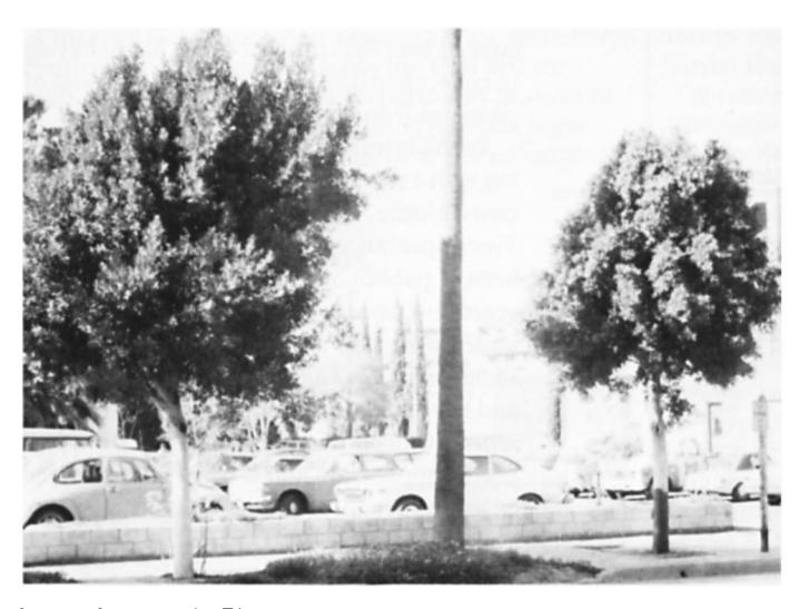
Laurel fig trees in Riverside with large rounded canopies, banded in 1979 and 1980 (at right), had an acceptable appearance and reduced shoot growth through early May 1980.

Treatments are reapplied when vigorous regrowth indicates that shoot growth inhibi-