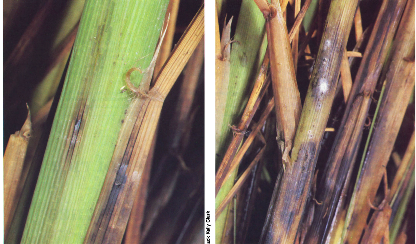
Early symptoms of stem rot on rice (left), and its inward progression through layers of leaves to culm (above and facing page).

rice. Steps in this process were to collect a broad array of the related species, screen them for stem rot resistance, and then hybridize the resistant species with a California rice variety to begin the transfer of resistance to high-yielding varieties.