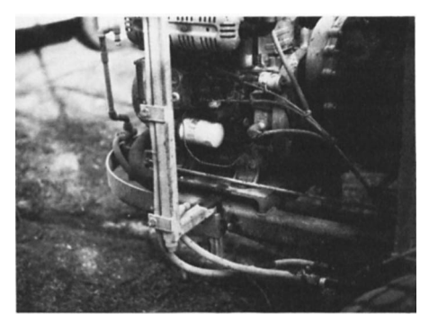
Close-up of attachment of vertical boom on conventional horizontal-boom weed sprayer. Bolts and brackets permit easy removal

The date of citrus petal-fall may vary from one to three weeks in the SJV,