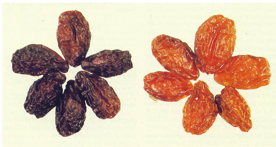
Sulfur treatment to create golden color of prunes (right) kills Rhizopus fungus spores.