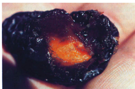
"Box rot" fungus infection of French prunes is characterized by macerated, wet, sticky areas on the fruit surface and a skin that slips with the slightest pressure.

storage at temperatures below 41°F to prevent rhizopus rot.