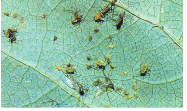
The insecticide diazinon was superior to soaps and detergents against aphids on squash (above). Sprays of Safer soap applied weekly significantly reduced cabbageworm numbers and damage but also depressed harvest weight of treated cabbage.

Neither diatomaceous earth nor a spray preparation made of strained, macerated worms was found to have value for control of worms on cabbage, at least under the conditions described here.