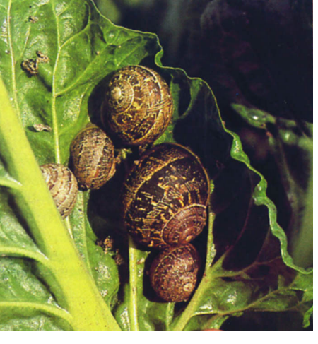
Baits are effective against the brown garden snail, but some home gardeners prefer not to use them for various reasons.

Ridges of barrier materials on plastic sheets formed snail test arenas. An elevated board in the center of each arena provided cover for snails.