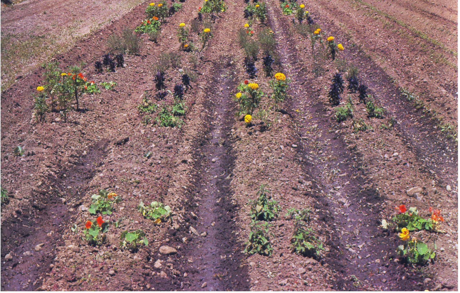
In the 1982 planting, nasturtium, marigold, catnip, summer savory, and basil were used as companions to cabbage plants.