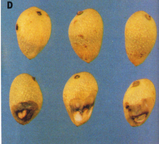
Four types of epicarp (skin) lesion symptoms: (A) surface lesion, (B) stylar-end lesion, (C) necrotic spots, (D) internal browning. These symptoms may occur at random.

Clusters of 'Kerman' pistachios enclosed in an open-mesh cloth bag with leaf-footed bug for 48 hours developed symptoms of epicarp lesion within a short time (right). Control clusters enclosed in bags without leaf-footed bug were undamaged.