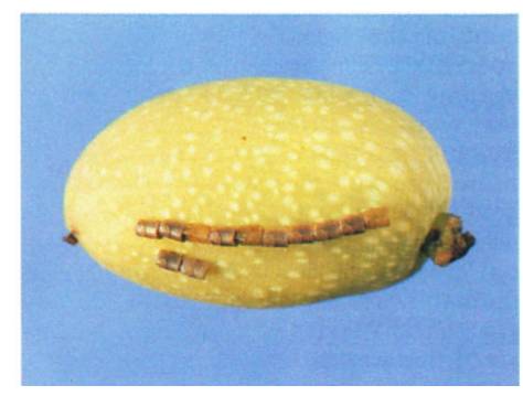
Adult leaf-footed bug and its eggs (segmented strip on pistachio nut at right).

nate at random on the fruit, and they were the most common symptoms of epicarp lesion during the 1983 growing season.