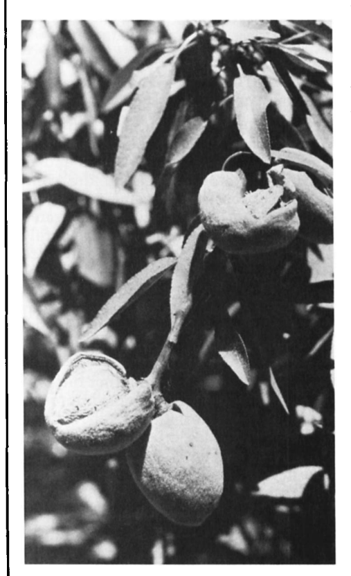
Almonds at hull split, near harvest time. Pesticide-resistant predators help control spider mites in California almond orchards.

Some insecticides used to control the navel orangeworm, Amyelois transitella