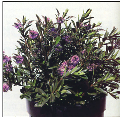
Veronics ( Hebe spp.) are widely grown in California for their evergreen foliage and bright, persistent white and lavender blooms.