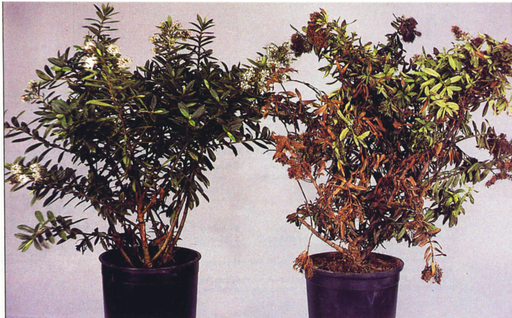
A new Hebe 'Coed' plant grown in a container and fertilized with calcium nitrate, phosphorus, and potassium chloride (left) was protected from Fusarium wilt, even when planted in infested soil. Plant at right, on ammonium sulfate program, shows disease symptoms.