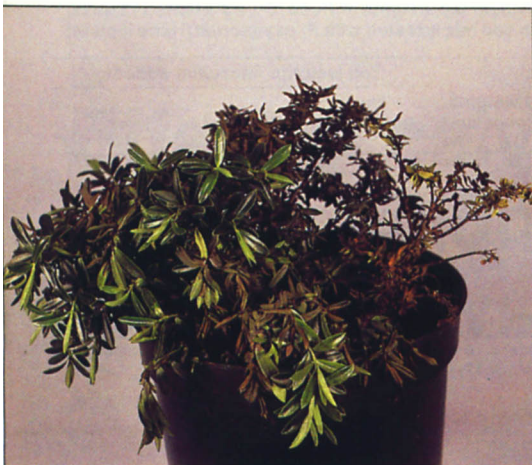
Plants affected by Fusarium oxysporum show uneven die-back of foliage, particularly in warm weather. Entire plant may die.