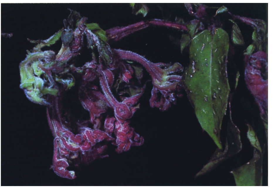
A healthy fuchsia, such as the one at left, is one of the most attractive and popular of flowering plants among California home gardeners and hobbyists. The recently discovered fuchsia gall mite disfigures plants, causing twisted and distorted leaves and swelling and reddening of tissues.