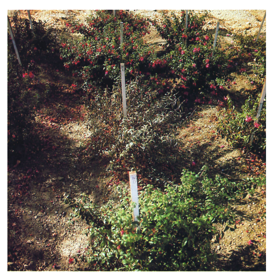
Foliar discoloration on carbaryl-treated fuchsia plants was attributed to spider mite feeding (plant in center of row) and not to chemical injury.

• t = no symptoms; 2 = trace of injury; 3 = moderate injury; 4 = severe injury.