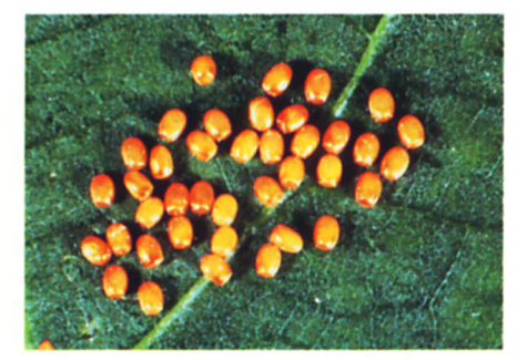
Omnivorous looper egg cluster