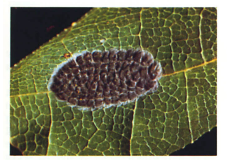
Parasitized Amorbia egg mass