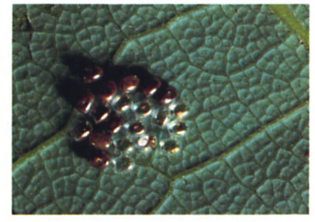
Parasitized looper egg cluster