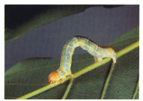
Omnivorous looper larva