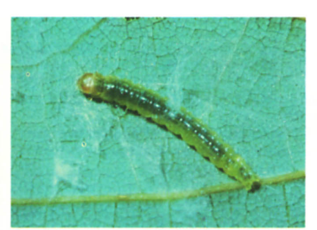
Amorbia cuneana larva