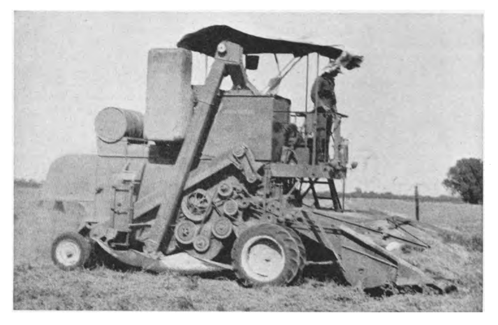
Self-propelled combine harvesting in a field with heavier-than-average windrows. The canvas sheet suspended beneath the machine catches any seed that leaks out. The ground-driven belt-type windrow pick-up was the most satisfactory type observed. The windrow here is being lifted with a minimum of disturbance.

Because of the relatively large amounts of chaff and small pieces of straw encountered in harvesting alfalfa, the limiting Continued on page 16