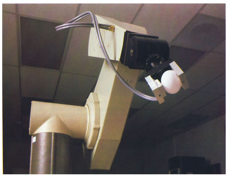
A more advanced state-of-the-art Puma 560 robotic arm markedly speeded up the egg candling process over the prototype model. The goal is to develop an intermediate model that is faster than the Rhino but less costly than the Puma.

The estimated initial cost of a robotic egg candling system is about $42,000 (table 1), and the annual operating cost