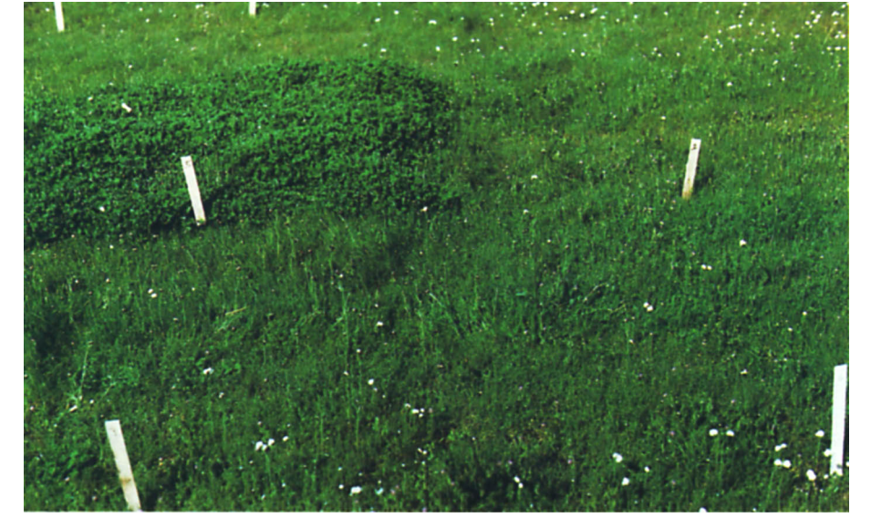
TABLE 3. Fertilization and clipping effects on forage dry weight and crude protein