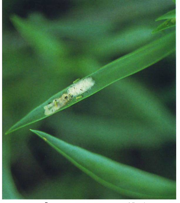
Beet armyworm egg mass and first-instar larvae on carnation leaf.

firms field observations that infestation levels are highest during the summer and very low during winter and spring.