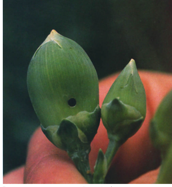
Beet armyworm damage to flower bud.

These behaviors are critical in protecting the earlier instars, which are generally more susceptible to insecticides. Older larvae appear to be less selective in their diet and are not restricted to the younger plant tissues. Tolerance of older larvae to