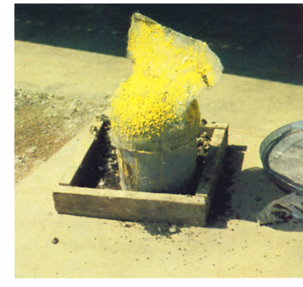
Widely used in poultry facilities, methomylbased poison bait stations are effective and may delay development of pesticide resistance.

Permethrin, naled, and methomyl are probably the most popular insecticides for control of the little house fly. Permethrin is used primarily as a residual spray and is the only pyrethroid registered for fly control in California poultry facilities. The highest resistance ratio encountered for permethrin, 9.0 at Cherry Valley, may be considered low in light of the intensive use of the insecticide at that location. Recent studies with cyromazine, a feed-through larvicide for use in cagedlaying facilities, have shown extremely high populations of little house fly adults