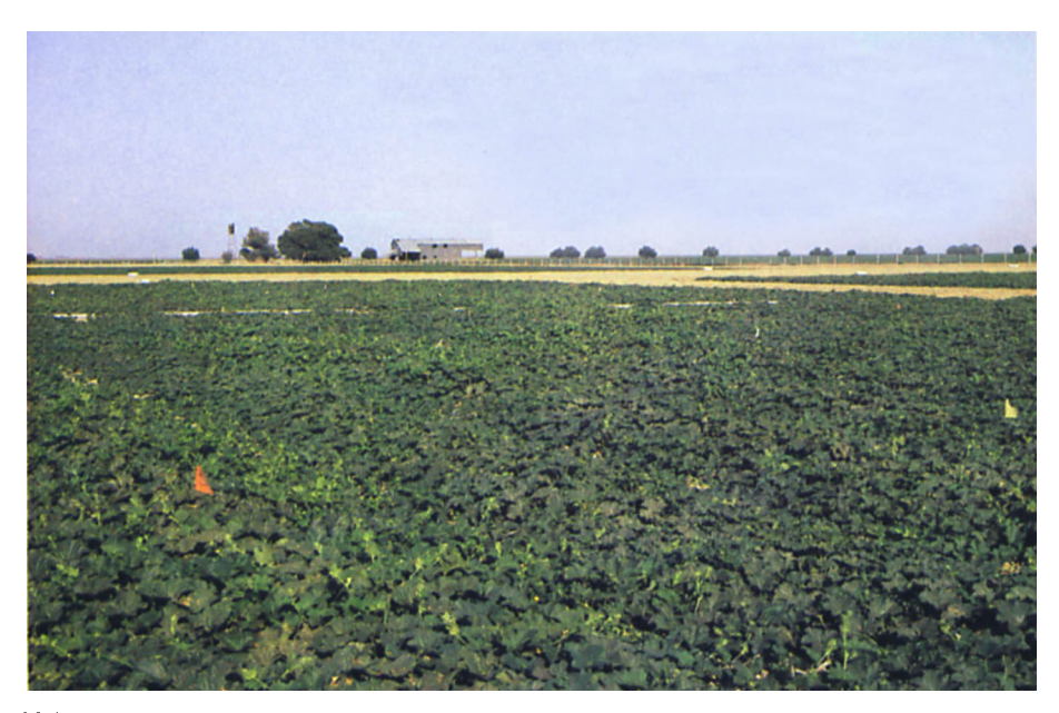
Melons irrigated with saline drainage water at the West Side Field Station had only insignificantly lower yields than those irrigated with high-quality aqueduct water.