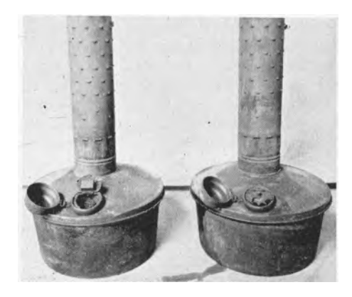
Two views of automatic regulator. Left, regulator is open, ready for lighting. Thermostat is in the small housing visible on the regulator plate. Right, plate has been closed by hand immediately after lighting, but thermostat holds it up off of seat during two- to three-minute warming-up period.

The superiority of automatic regulators over standard regulators, as indicated by the lower and upper curves on the smoke graph, may result in part from the automatic control of the starting draft. More probably, however, it is due to improved design of the regulating device. The introduction of air through the smaller regulating holes, the reduction of air leakage around the edges of the regulator, and the uniform burning rates obtainable with this device are all factors which tend to reduce the soot accumulations and the corresponding smokiness.