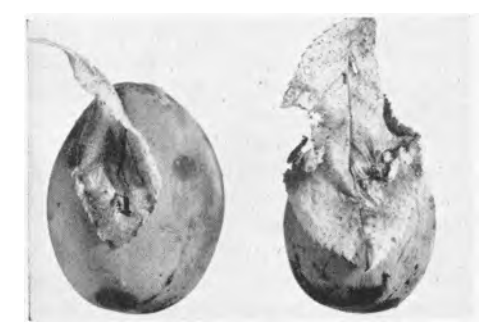
Bud moth injury to prunes.

The orange tortrix-Argyrotaenia citrana (Fernald) -- is an omnivorous feeder