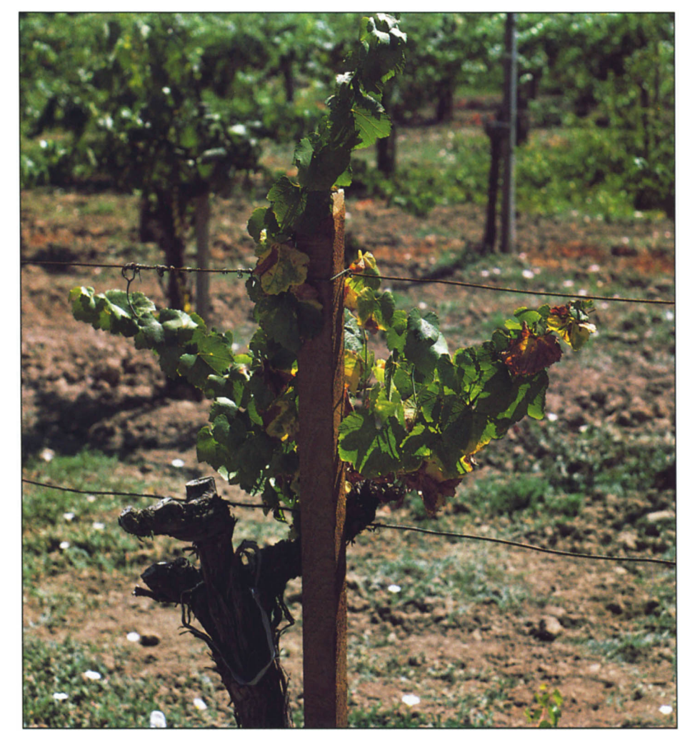
Although it is less serious now than it once was, Pierce's disease can totally destroy some vineyards. Severe outbreaks still occur in parts of the Napa and San Joaquin valleys.

The symptoms of Pierce's disease are first evident midway through the growing season and become more severe during the fall. For most grape varieties, the most noticeable symptoms are drying or scorching of the leaves. Portions of the leaf margin become yellow and then dry. Leaves of red-fruited varieties usually show some red discoloration. Over a period of days to weeks, successive portions of the leaf turn yellow and then dry, resulting in concentric patterns of dead tissue. These dead portions eventually extend