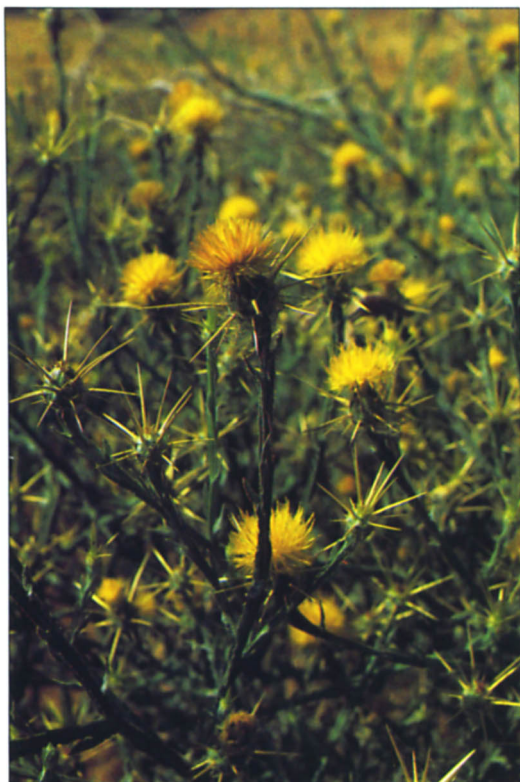
Yellow starthistle at flowering stage forms sharp spines that can injure grazing animals.

To find ways of managing yellow starthistle, we compared the weed's response to intensive cattle grazing with and