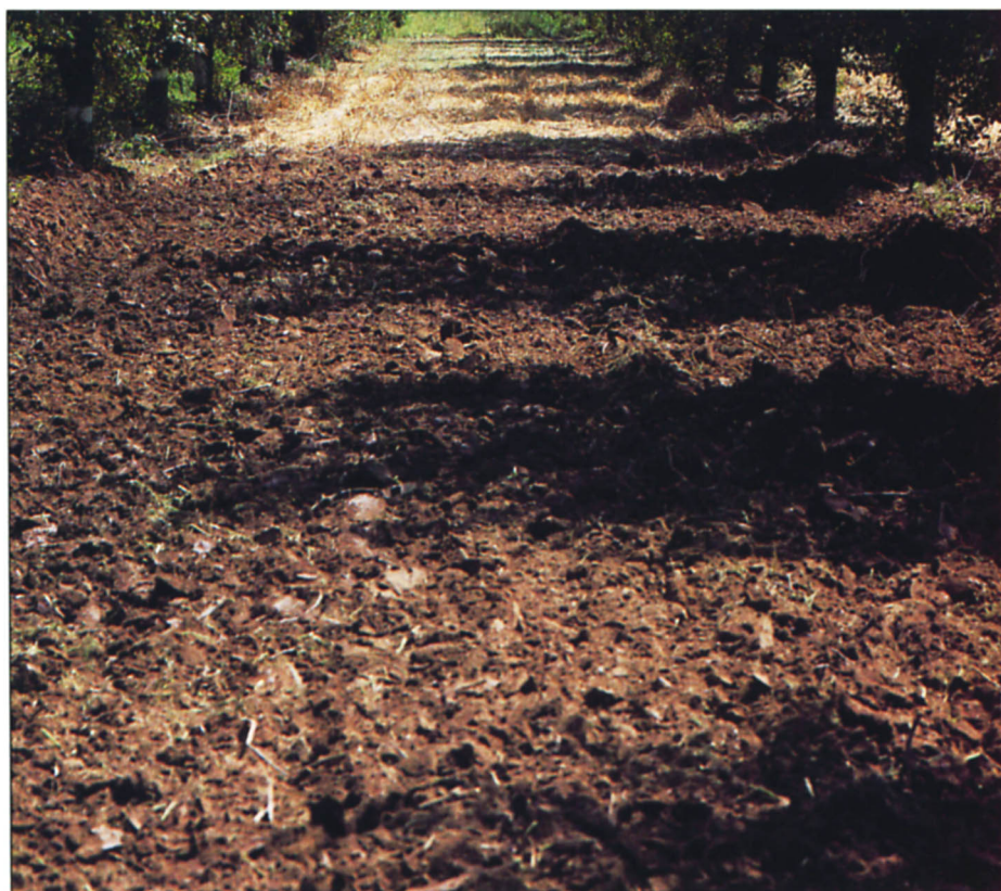
Orchard floor treatments, at midseason, included clean cultivation (foreground), planted annual grass killed with an herbicide application (background), and mowed, planted annual grass (distant background). Permanent cover was also tested.