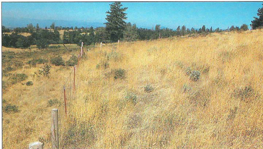
Vegetation patterns differ dramatically on two sides of the cattle enclosure fence.