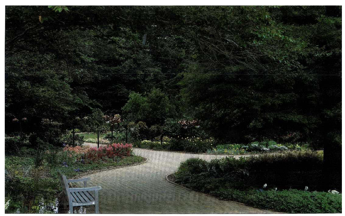
Urban horticultural center.