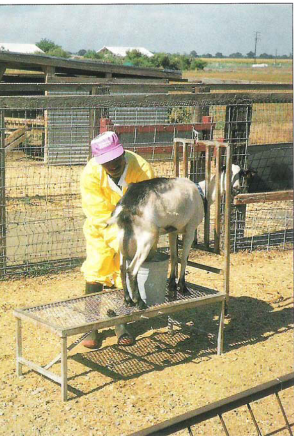
Researcher obtains milk from a goat fed with poison oak.

and 22% with a mean of 19.8%. The mean ADF was 13.5% (range 11 to 17%) and is comparable to oats. The leaves were also high in calcium (1.2%) and phosphorus (0.46%), similar to a legume forage.