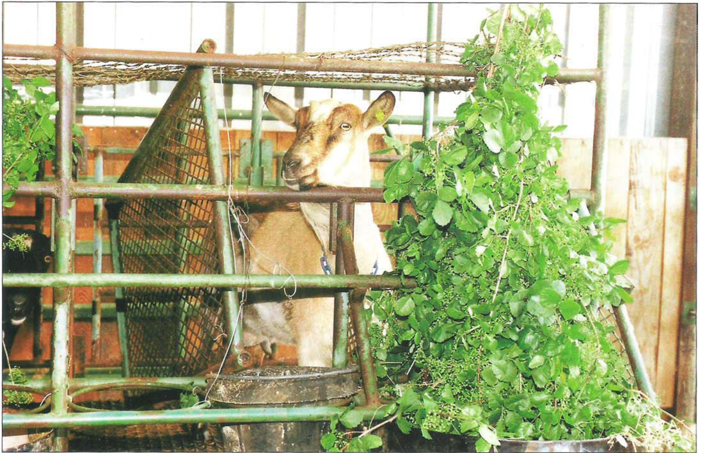
A dairy goat eats poison oak in a feeding station at UC Davis.