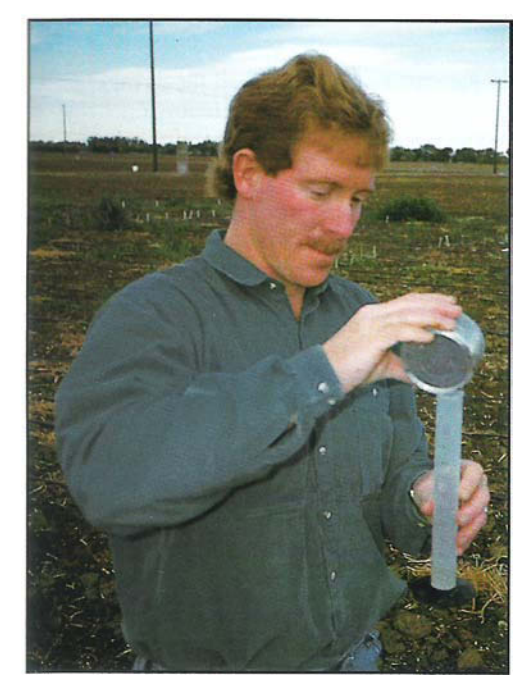
Above, water collected during monitoring of drip tape is measured.

At left, a PVC trough is used to collect discharge from a 5-foot section of drip tape.