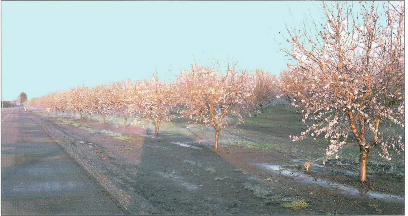
Almond orchard north of Chico which was site of ground cover experiments.