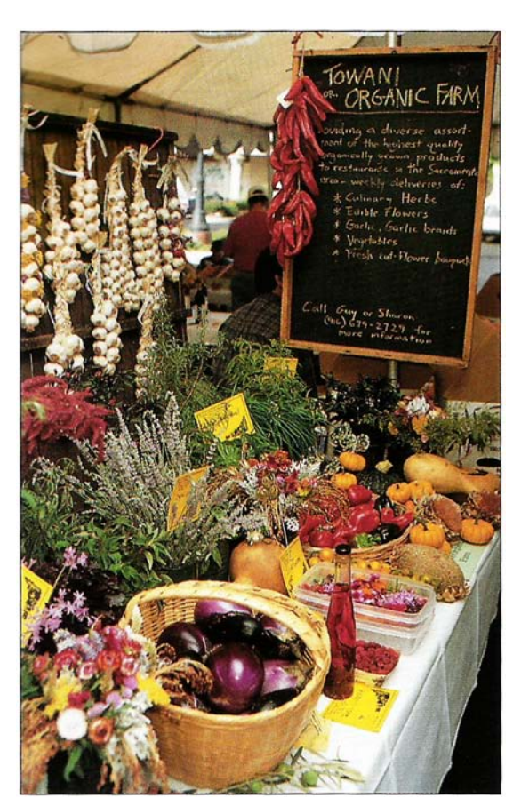
Organic produce displayed by one small farmer at the Sacramento Summer Harvest Tasting in September, 1992.

oped to meet specific conditions. A policy to promote the family farm implies that, over time, it will be necessary to evolve production and marketing systems that will reinforce the competitive position of the smaller farm unit. Through the university system, the taxpayer dollar already supports what many feel to be the best agricultural research and extension capability in the nation. Its ingenuity in helping shape an agriculture well adapted to large farms bespeaks ample talent that could and should now be turned to creating an equally sophisticated agriculture adapted to family farms. By way of example, this might mean development of smaller and more versatile farm equipment, cropping systems permitting practical diversification on smaller acreages, and innovations in delivering extension services to larger numbers of family farmers.