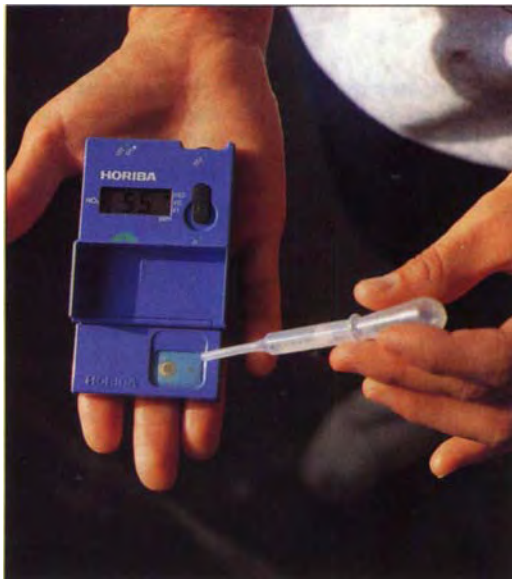
Analysis of petiole sap by nitrate-selective electrode can be a useful, on-farm nitrogen monitoring technique.

gating in more stressful environments may result in substantial yield losses.