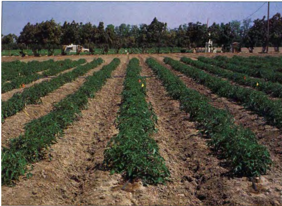
Drip-irrigated tomato plots at South Coast Field Station. Drip irrigation has become a standard practice for fresh market tomato production in California.

crop coefficients is that it more closely tracks the plant vigor of a particular field and is unaffected by field configuration. The published crop coefficients reflect "standard" field conditions and can require considerable modification for efficient use. The plants in both CIMIS ETo studies were irrigated either daily or three times per week.