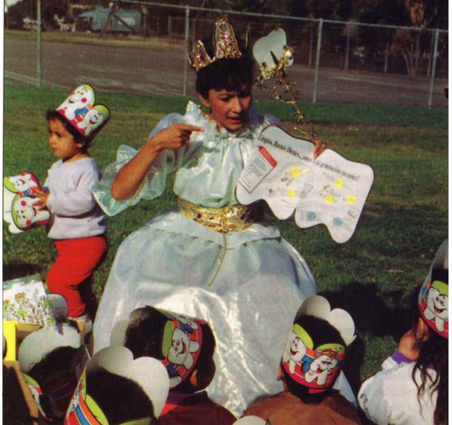
The "Tooth Fairy" discusses the benefits of healthy teeth with children completing the dental health nutrition education program