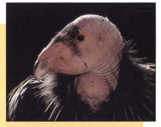
Conservation funds often go to endangered species that enjoy vocal public support, such as condors.

Even if regulators did not face these obstacles, priority-setting would be in trouble because the current system needs improvement. While many have criticized the current system for setting conservation priorities, few have suggested concrete ways of improving it. At one extreme, we could divide the money equally among the listed species. Another approach would be to save as many species as possible by fo-